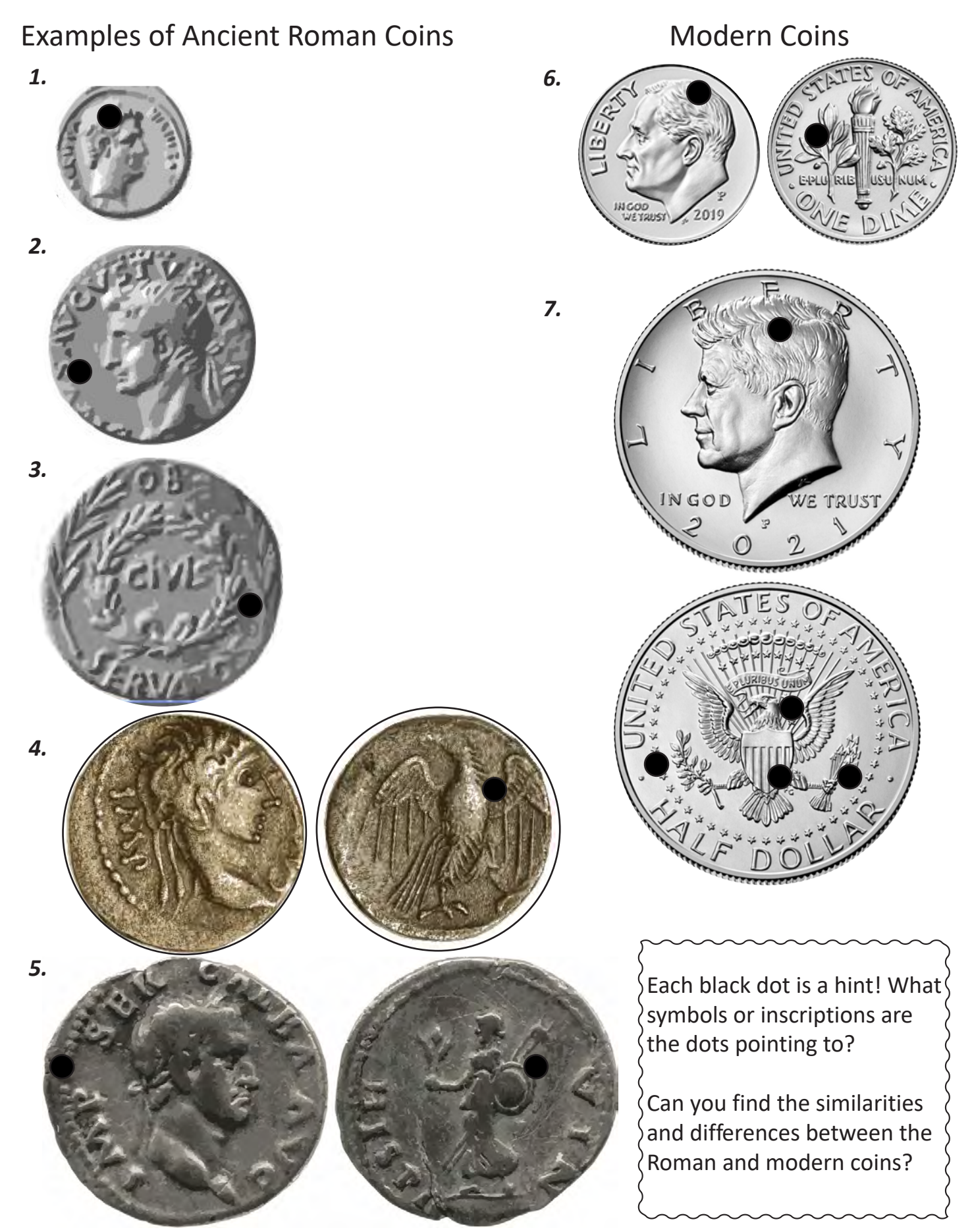
1. Rome, c. 13-12 B.C., 2. Rome, date unknown, 3. Rome, 20-18 B.C., 4. Rome, 10-15 B.C. 5. Rome, 68 B.C., 6. 2019 Dime, 7. 2021 Half Dollar coin